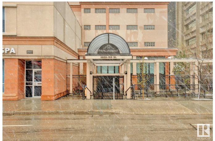
805-9939 109 St NW, Edmonton, AB