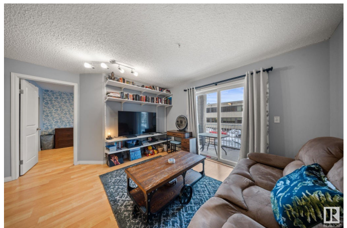
214-10535 122 St NW, Edmonton, AB